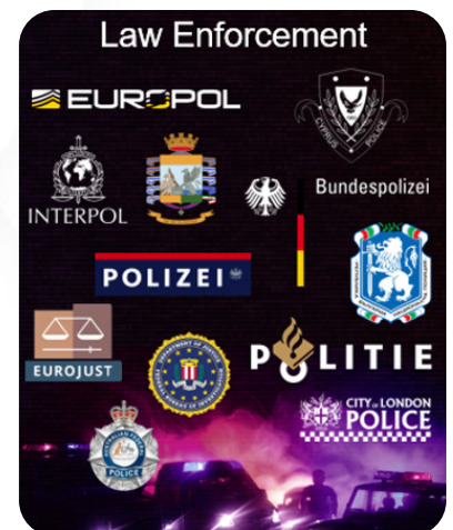
Figure 2. Key Relationships & Partnerships

Our team has broad legal, security consulting and law enforcement expertise and a wealth of experience in preparing casework and liaising with lawyers and prosecutors on a global scale. This ultimately reduces the risk and protects the bottom line.